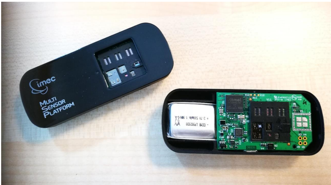
Fig. 1: Final MSP demonstrator device fabricated to fit into a wearable wristband device, which has been specifically designed for the MSP project by IMEC.

The final MSP-demonstrator system was designed, sophisticated sensor devices were fabricated, 3D-integrated on the platform chip, and finally mounted on a specific PCB including the wireless communication. The wearable wristband device with integrated MSP-demonstrator being the ultimate output of the MSP-project is shown in Fig.1. The MSP multi sensor system comprising a total of 57 sensor devices is a unique device worldwide – such a complex system has never been realized before.