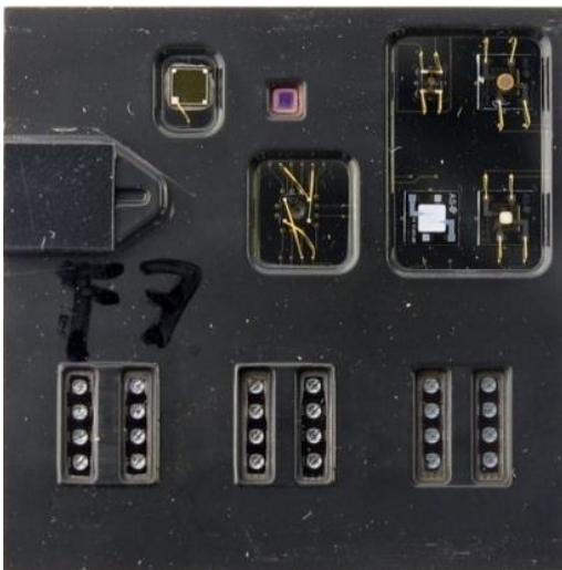
Fig.2a: Overmolded 3D-integrated MSP demonstrator device including a total of 57 sensor devices.

A unique highly complex full manufacturing process flow for 3D-stacking of the sensor devices on the PC2 including overmolding of the 3D-integrated system was realized in WP7 “Fabrication of 3D-integrated Demonstrator Systems”. Fig.2a shows the final MSP demonstrator device representing a unique integrated system worldwide. A wearable wristband device as housing and a proper PCB as carrier of the MSP demonstrator were designed and fabricated for the MSP demonstrator devices. Fig.2b shows the MSP demonstrator device on the PCB designed to fit into the housing of the wearable wristband device. The MSP demonstrator has a footprint of only 3 x 5 cm 2 and a total power consumption under real life conditions of < 50 mW!